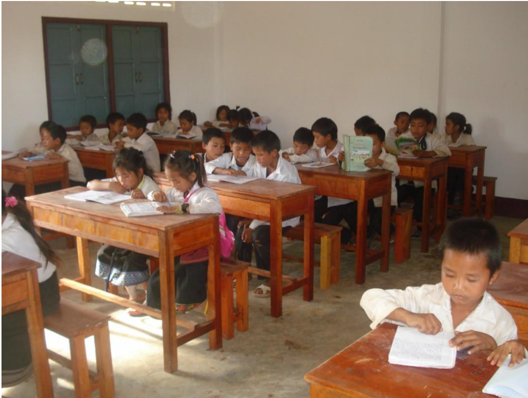
Children in their new classroom