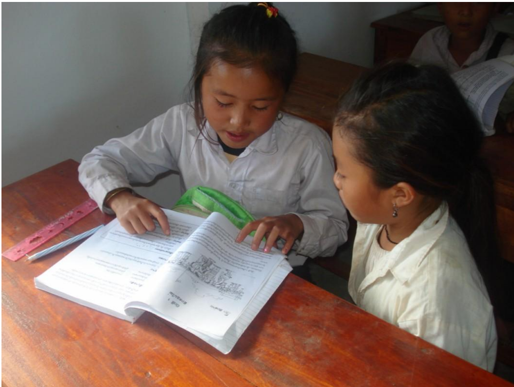
Two young girls share a book