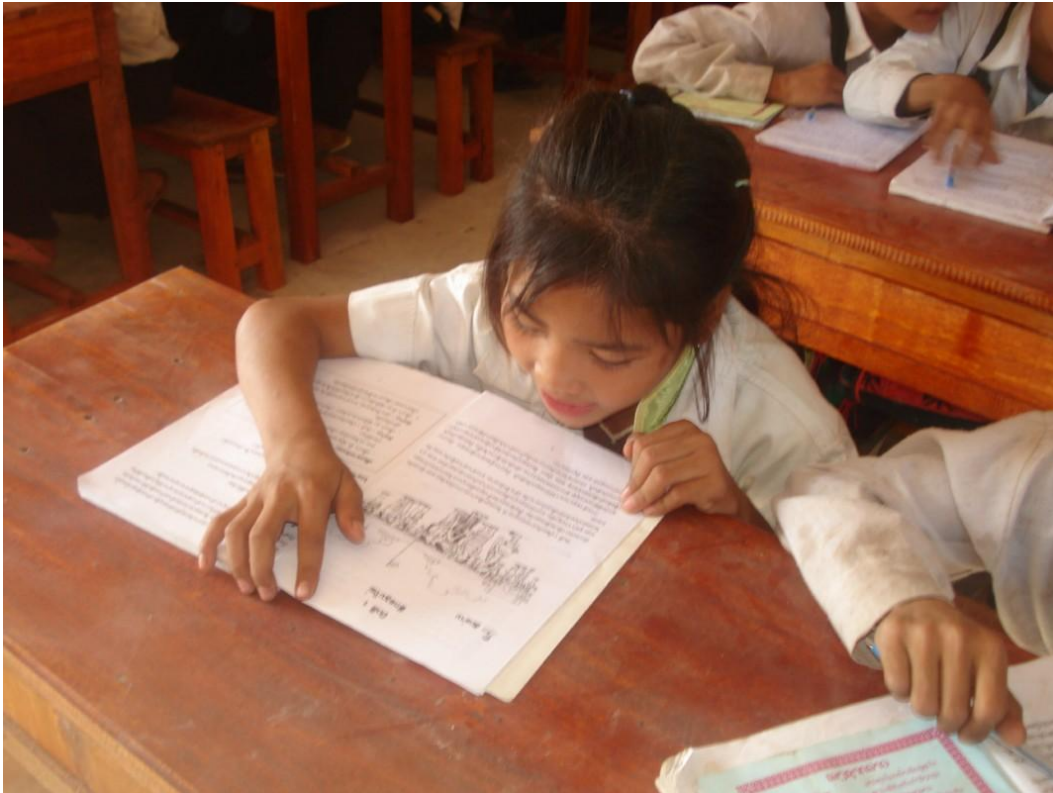
A girl reading at her desk