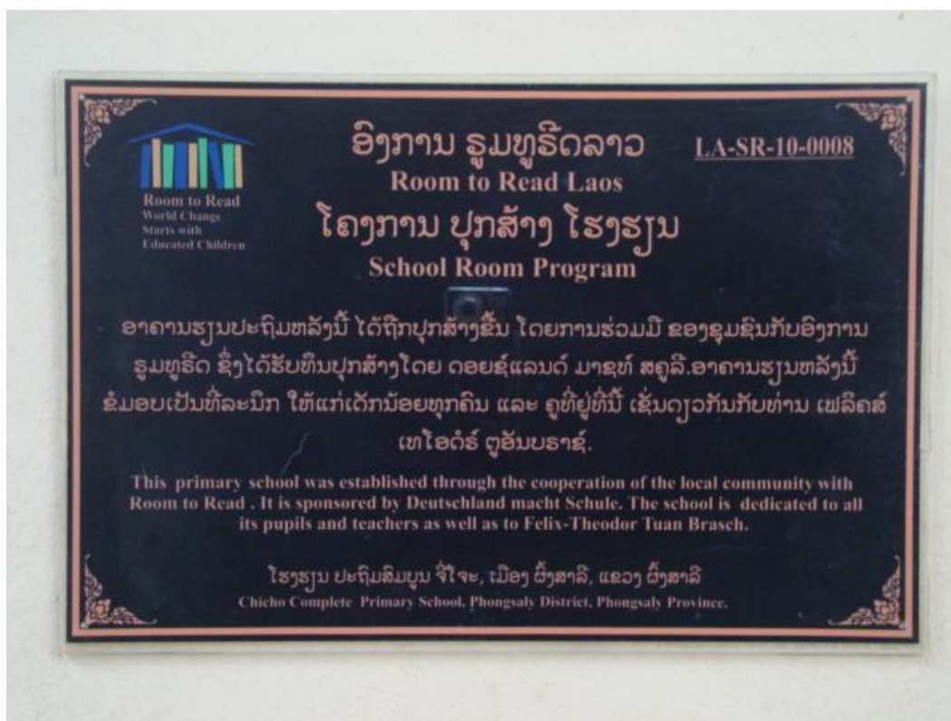
The dedication plaque for the new school