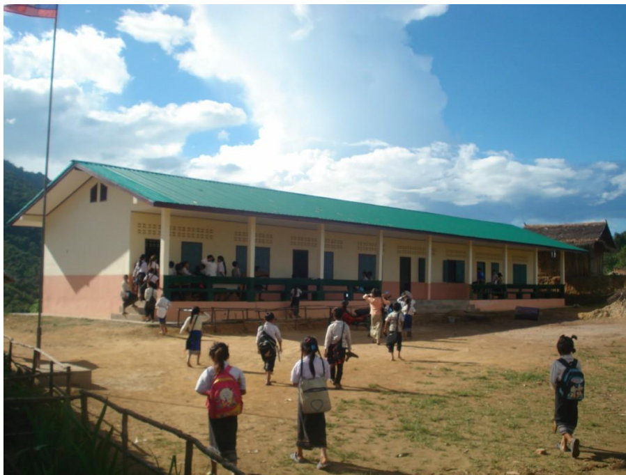
Overview of the new school building