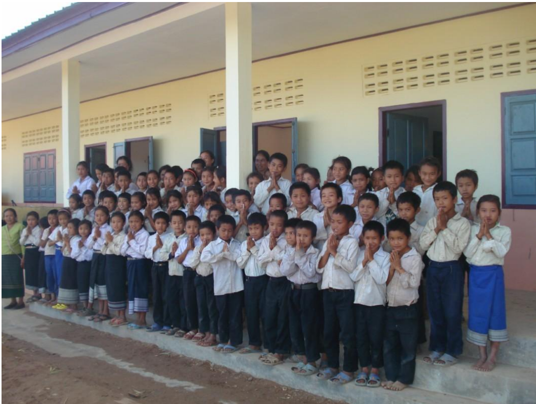
The children and their teacher pose for a photo