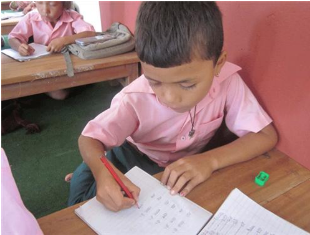
Close up photo of a child in newly constructed classroom.