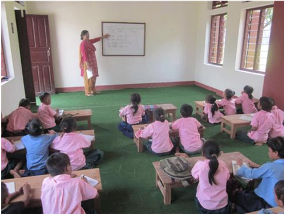
A teacher giving lessons in a newly constructed classroom.