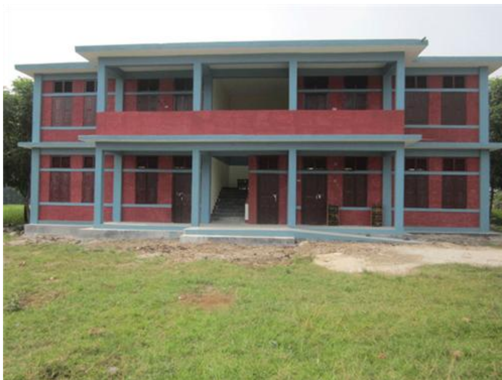
Newly constructed building of the school.