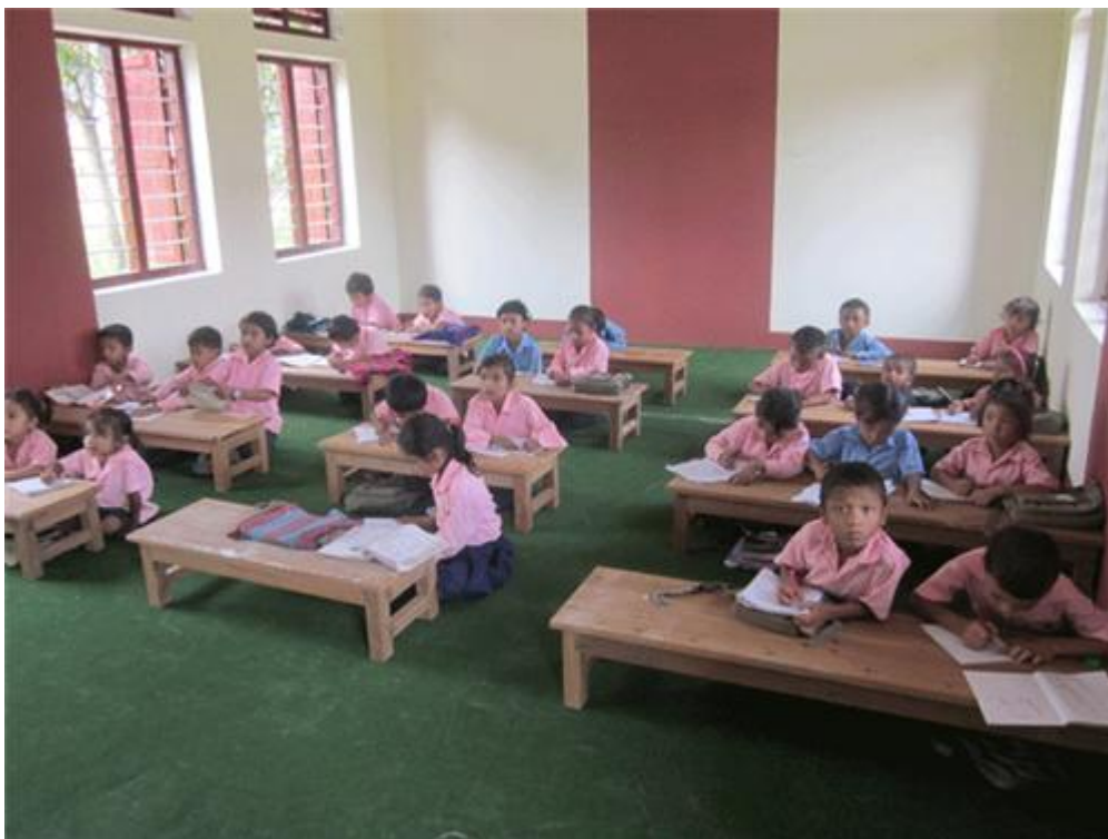
Students having lessons in a newly constructed classroom.