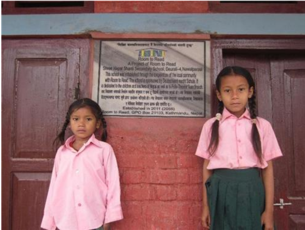
Two students in front of the school's dedication plaque.