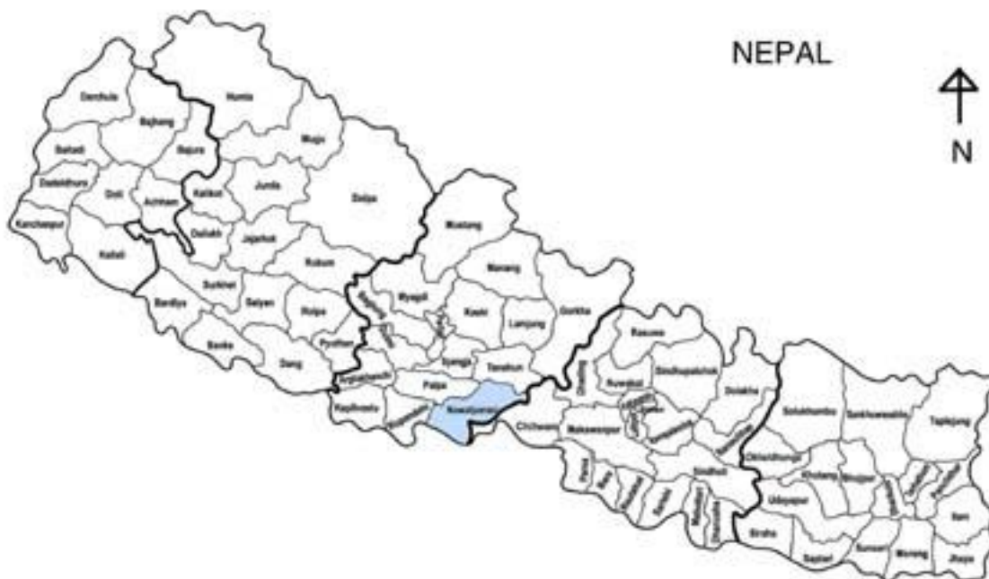
Map of Nepal with the Nawalparasi district indicated in blue.

Shree Nepal Shanti Secondary Secondary School is located in a village called Belhani, about 8 kilometers east of Narayangadh. It takes approximately 1 hour to reach the school from the Rupandehi field office.